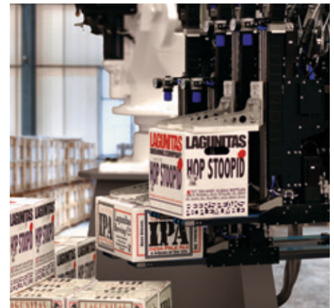
Mixed, partial or display loads