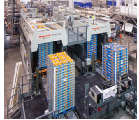
Variable packaging types

High-speed complex pattern forming – The act of individually conveying each case into position means pattern changes have a relatively small impact on rate. However, rates for robots can dramatically fall, as they depend on handling multiple cases at a time to achieve higher throughput. For example, changing from a nine-block, column-stacked pattern to a nine-block pinwheel pattern can frequently result in a 50 percent rate reduction on a robotic system.